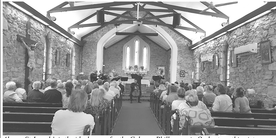
Above: St Joseph's is the ideal venue for the Cologne Philharmonia Orchestra - this picture was taken at the 3.00pm session on Saturday 18th January.

All delegates will be required to attend a preparatory day in June or July. The First Session is from October 4-11, and the Second Session from June 28 - July 3, 2021.